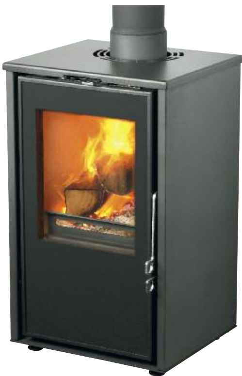
Serenity 40FW full length glass window