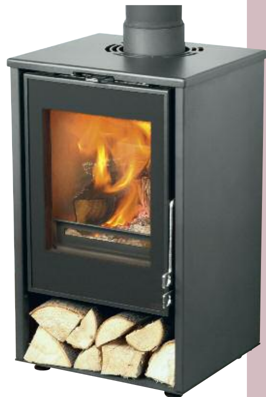
Serenity 40LS log store